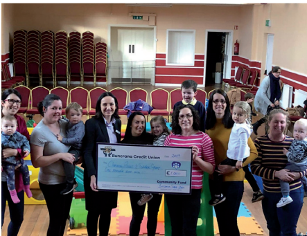
Clonmany Parent & Toddler Group receiving a donation of €1,000 from Buncrana Credit Union Community Fund

The financial statements were approved, and authorised for issue, by the Board on 27 th January 2020.