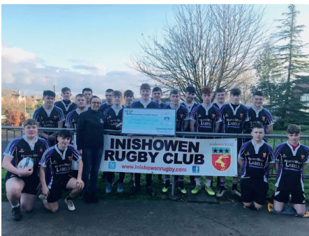
Inishowen Rugby Club receiving a donation of €1,000 from Buncrana Credit Union Community Fund