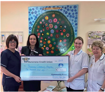
Buncrana Community Hospital receiving a donation of €1,000 from Buncrana Credit Union Community Fund

We communicate with those charged with governance regarding, among other matters, the planned scope and timing of the audit and significant audit findings, including any significant deficiencies in internal control that we identify during our audit.