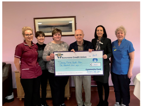
St Columbcille Village receiving a donation of €1,000 from Buncrana Credit Union Community Fund