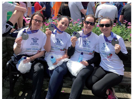
Staff members taking part in the Relay for Crumlin fundraising event