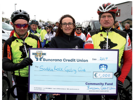
Saddlerock Cycling Club receiving a donation of €1,000 from Buncrana Credit Union Community Fund